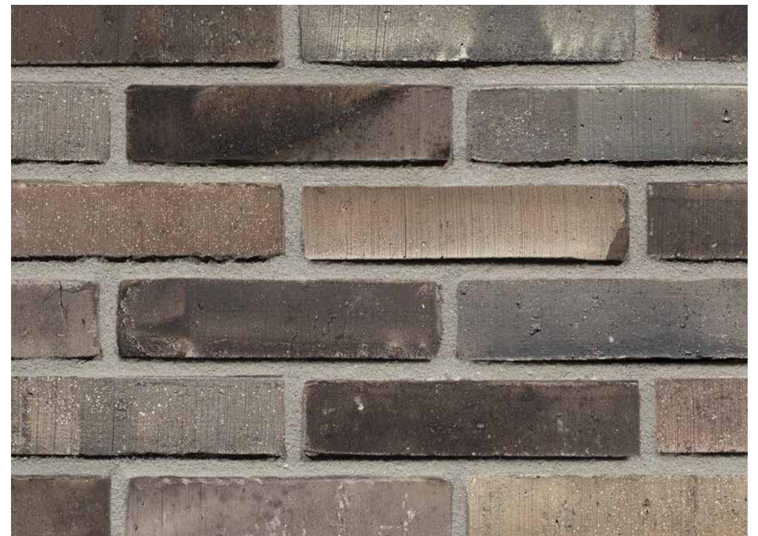
Lumina WF approx. 210x100x50 mm