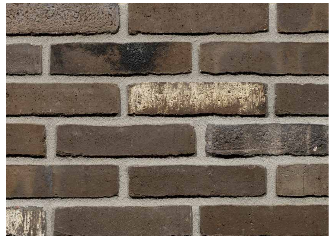
Optima WF approx. 210x100x50 mm

Also available in VF – approx. 210x100x40 mm