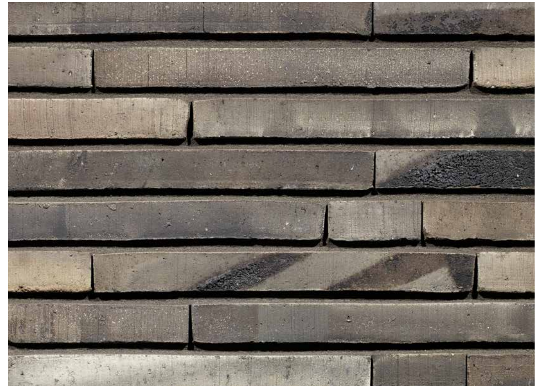
Lumina LF approx. 400x100x40 mm