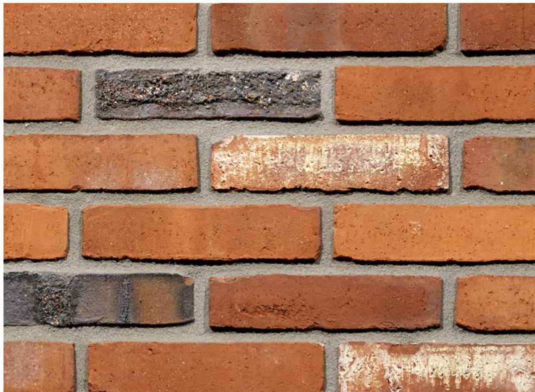
Fortuna WF approx. 210x100x50 mm