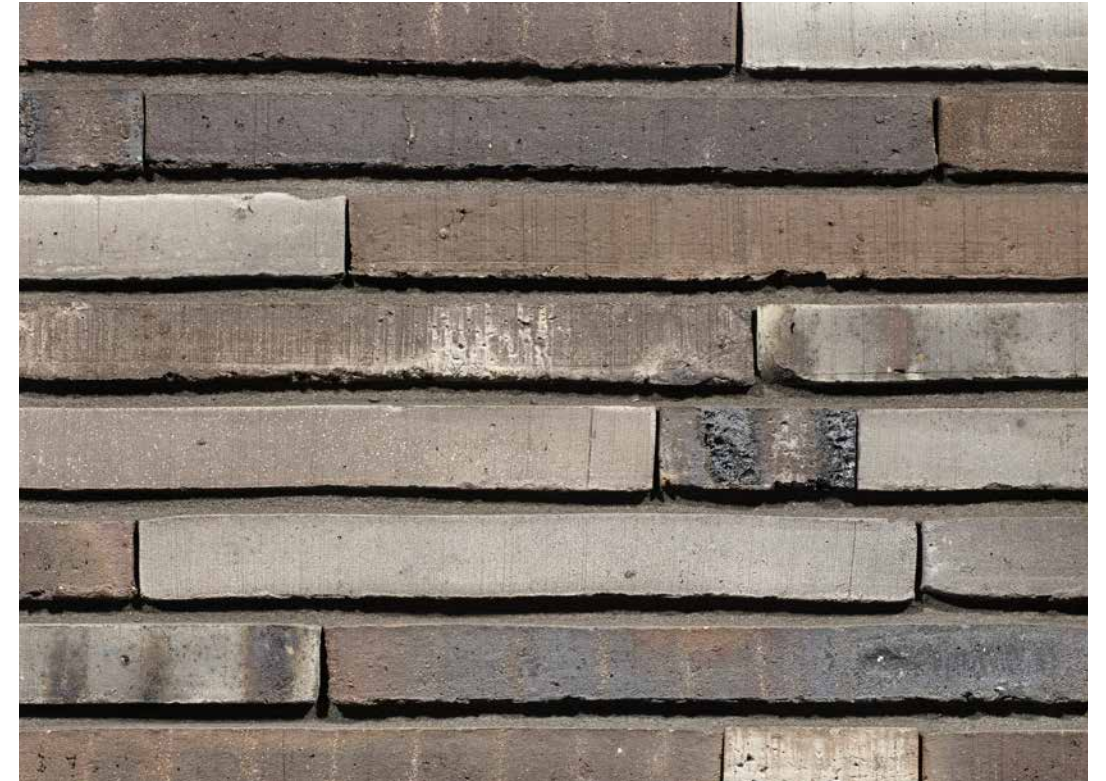
Famosa LF approx. 400x100x40 mm