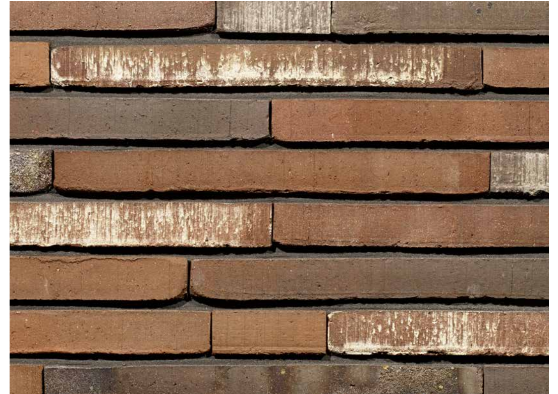
Maestra LF approx. 400x100x40 mm