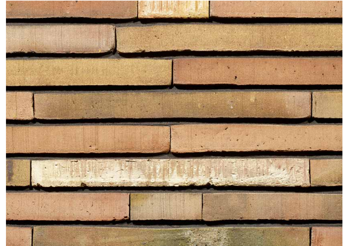
Dignita LF approx. 400x100x40 mm

Also available in VF – approx. 210x100x40 mm