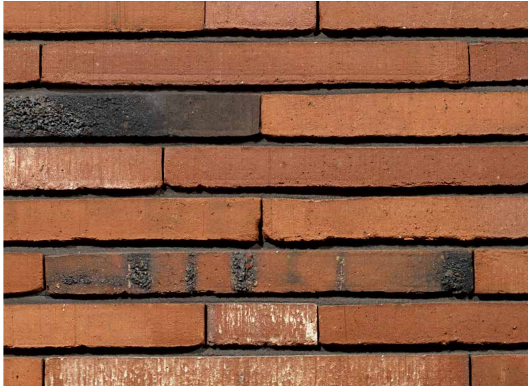
Fortuna LF approx. 400x100x40 mm