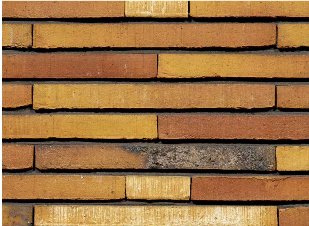
Prisma LF approx. 400x100x40 mm