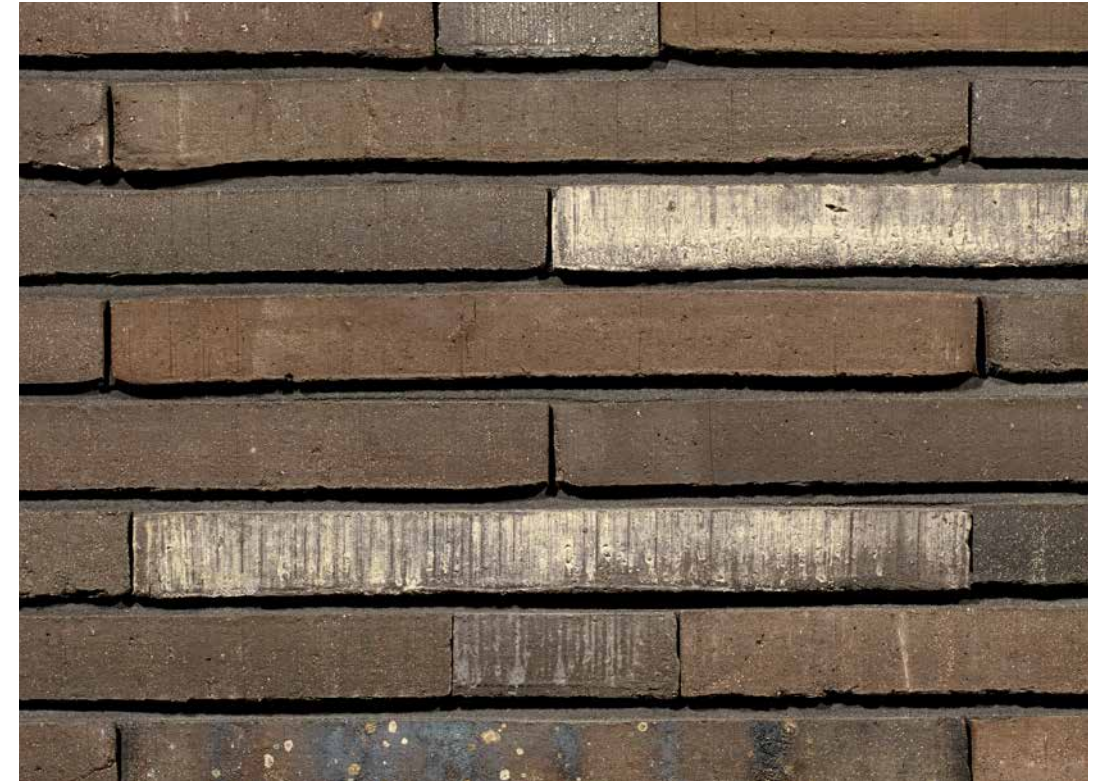
Optima LF approx. 400x100x40 mm