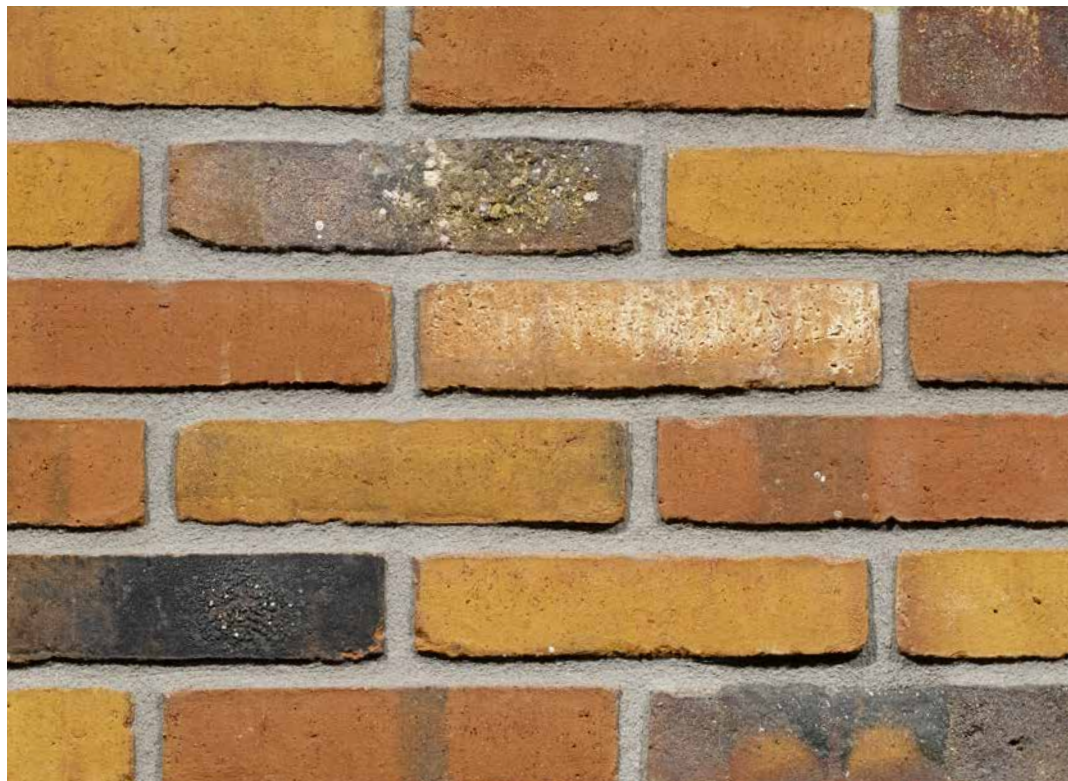
Prisma WF approx. 210x100x50 mm