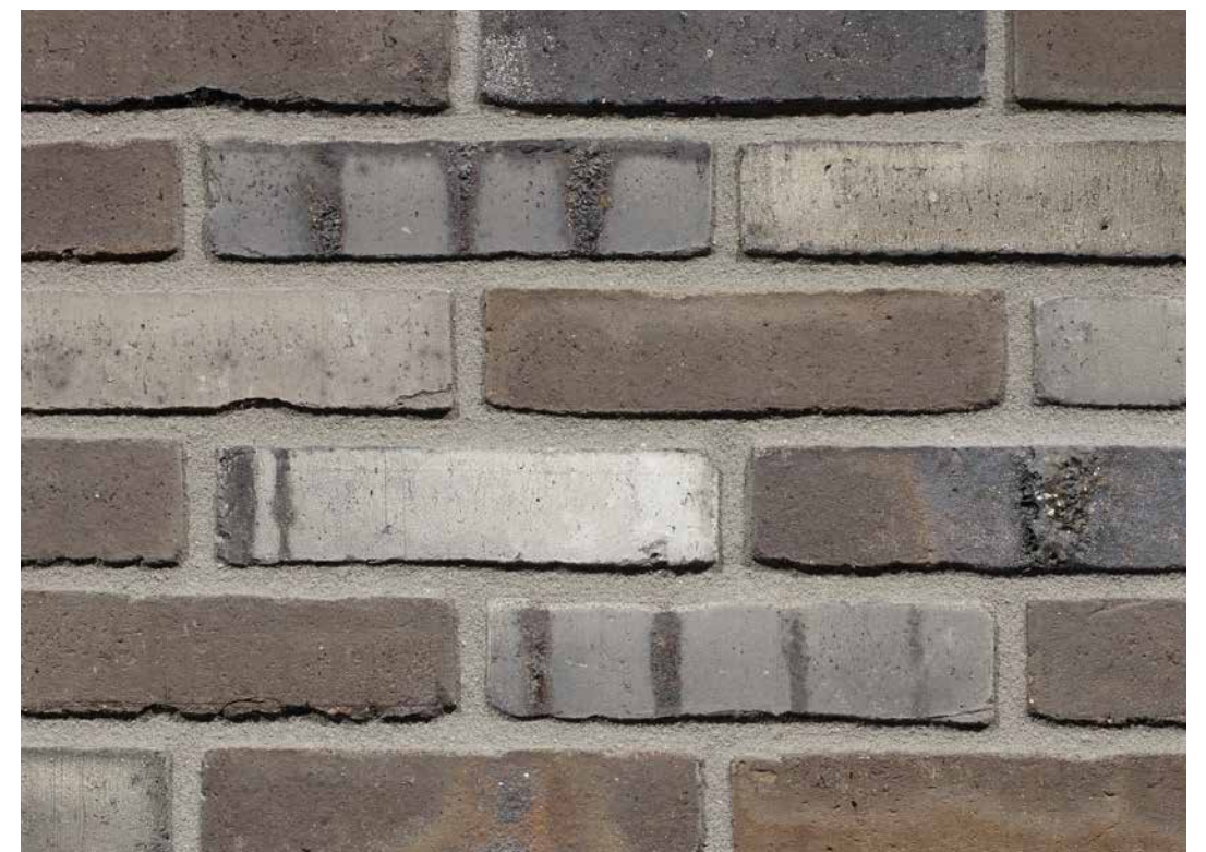
Famosa WF approx. 210x100x50 mm

Also available in VF – approx. 210x100x40 mm