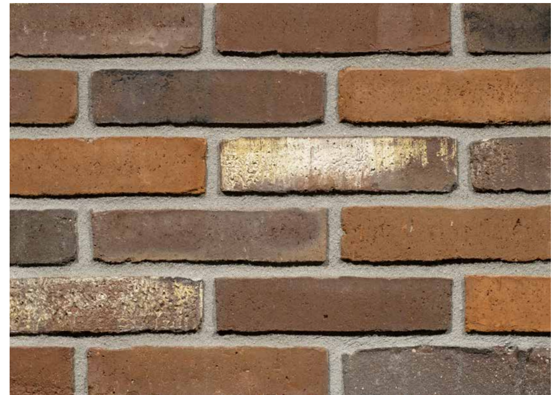
Maestra WF approx. 210x100x50 mm

Also available in VF – approx. 210x100x40 mm