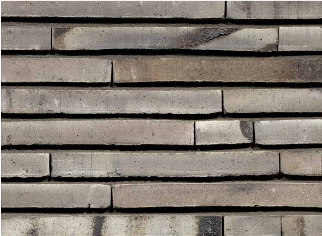
Estrella LF approx. 400x100x40 mm