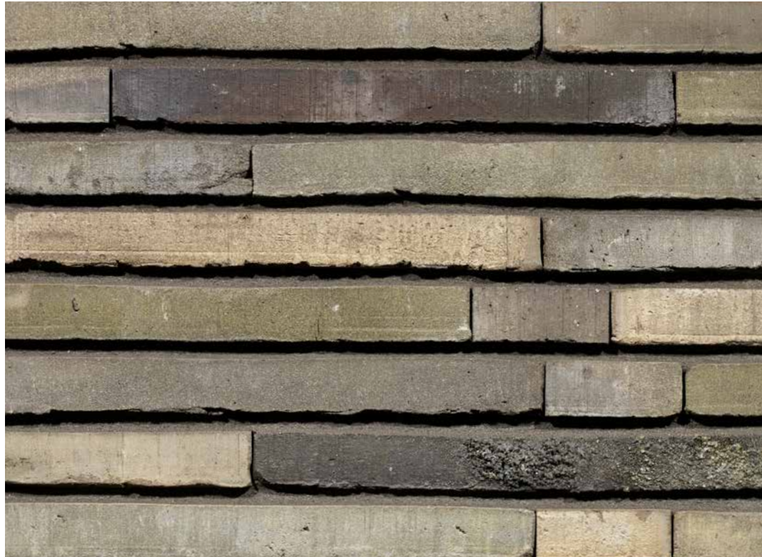
Virtua LF approx. 400x100x40 mm