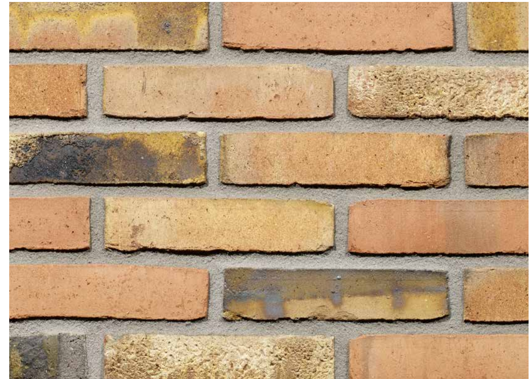
Dignita WF approx. 210x100x50 mm