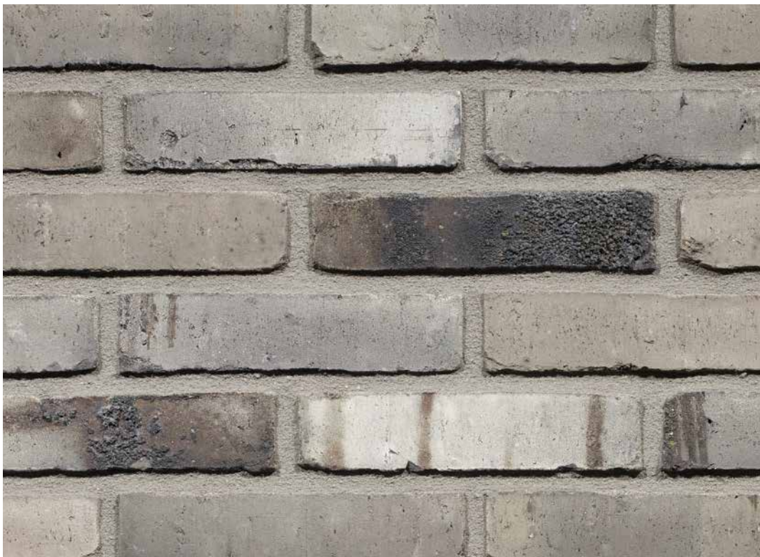
Estrella WF approx. 210x100x50 mm