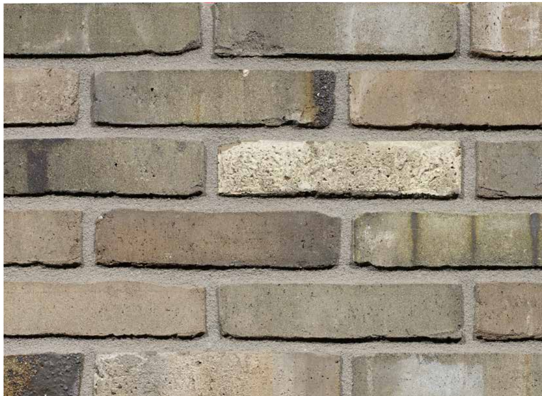
Virtua WF approx. 210x100x50 mm