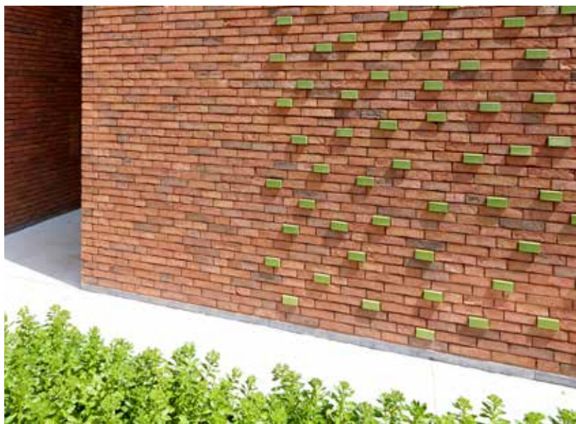
Renovation and expansion of the Engelendale residential care facility | Bruges, Belgium

YOU'LL FIND MORE PROJECTS AND INSPIRATION ON WIENERBERGER.NL/ GLAZED-BRICKS