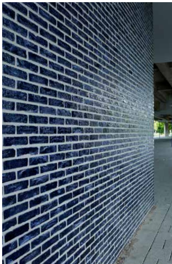
Renovation metrostation | Rotterdam