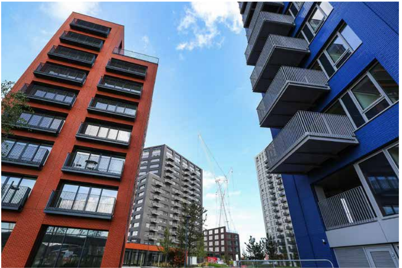
Glazed bricks in special colors of the Crystal series.