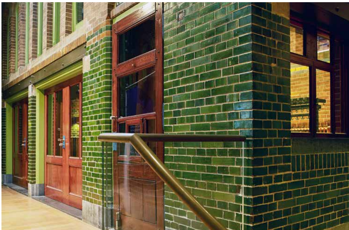
Restoration of Beurs van Berlage | Damrak, Amsterdam