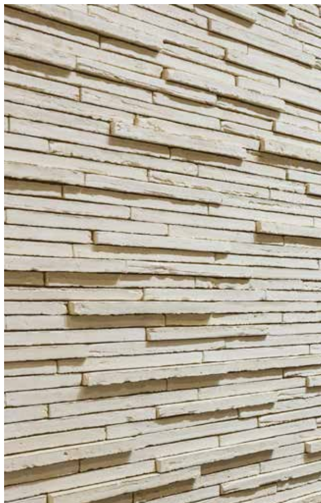
Wasserstrich Special White

You can process the bricks exactly as you want, in both newbuilds and renovation projects. Consider, for example, using thin mortar or glue with the long, slender bricks to emphasise the linear nature of the façade. In this way, the robust look and trendy appearance of Wasserstrich Special also get full attention.