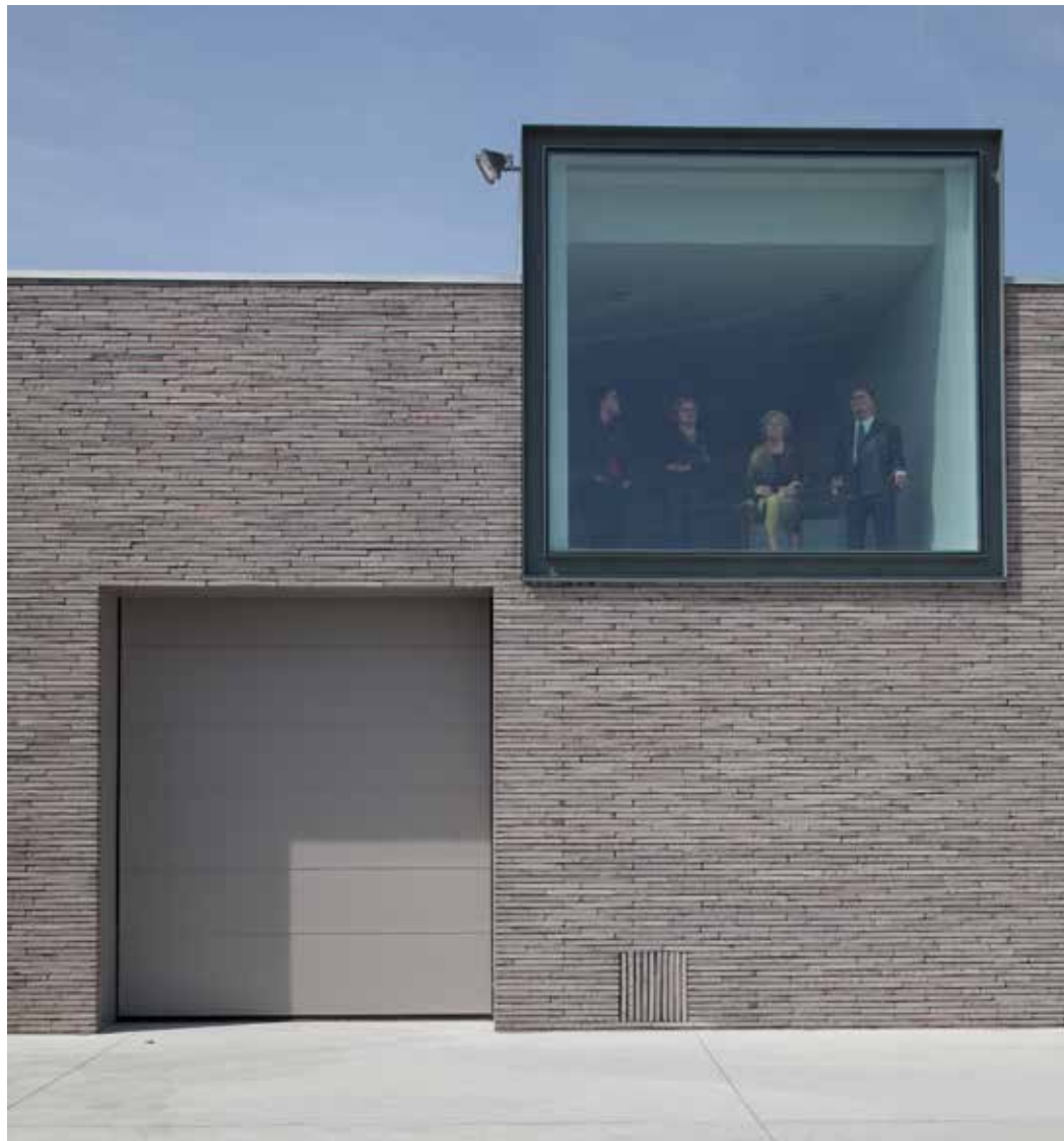
Wasserstrich Special Grey

Architectenbureau Janssens, Jo Janssens, Anzegem