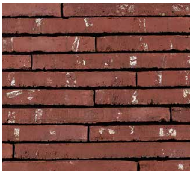
Wasserstrich Special Red ± 495x100x38 mm