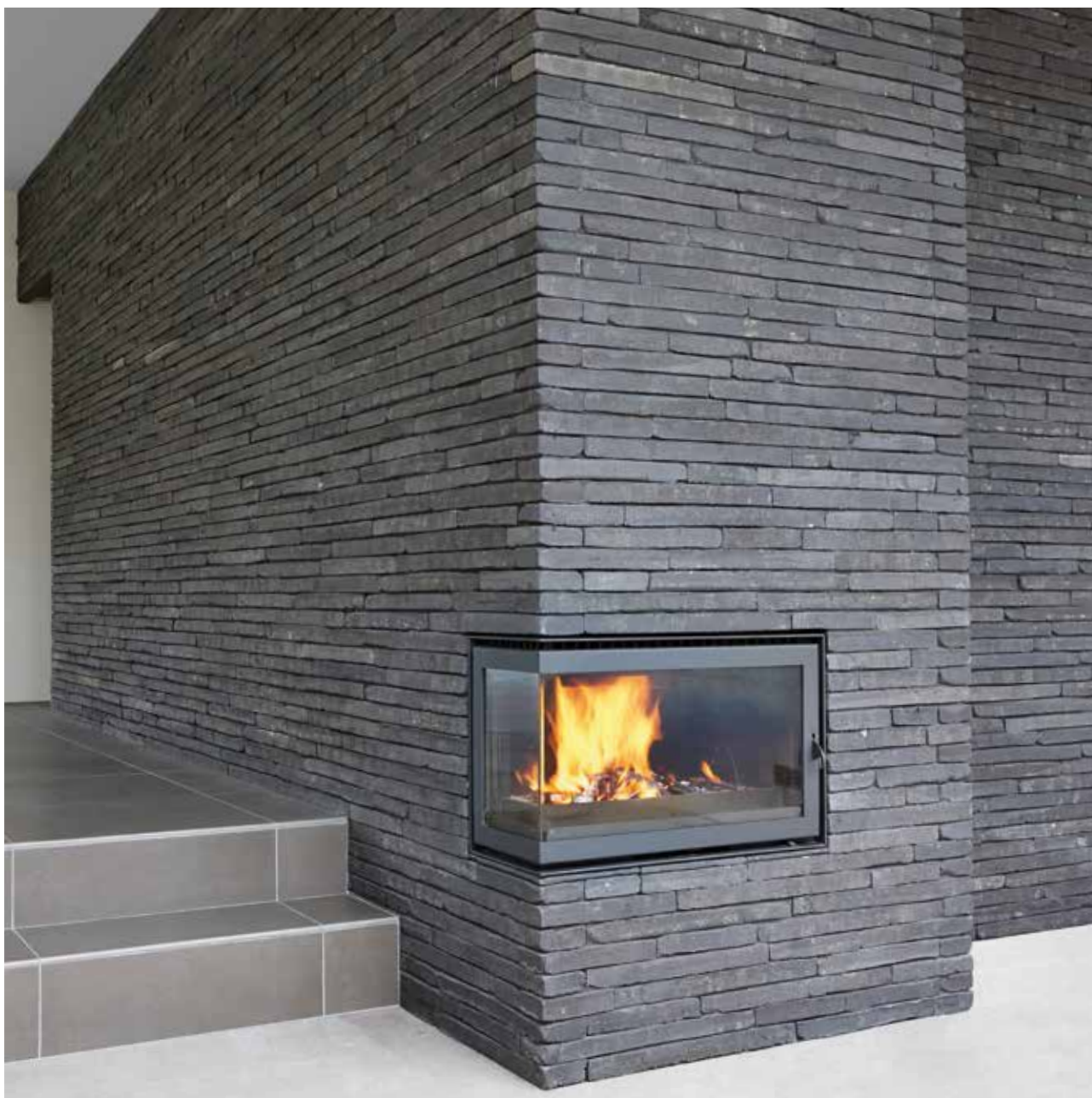
Wasserstrich Special Black

“Wasserstrich Special indoors: an exciting effect”