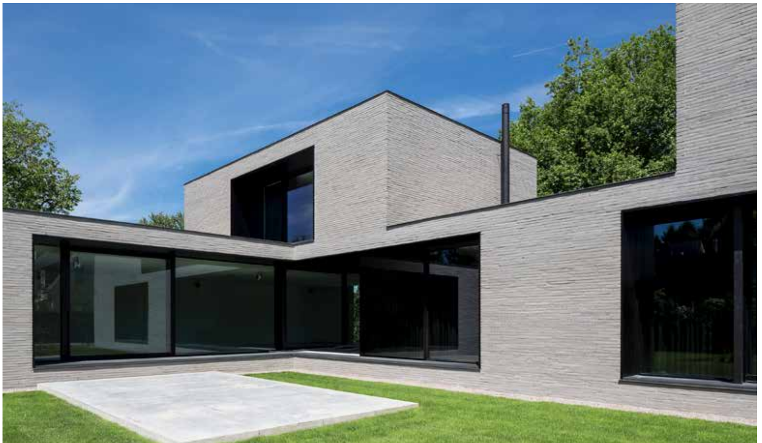
Wasserstrich Special Grey