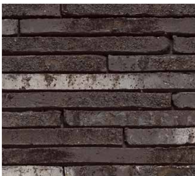
Wasserstrich Special E2 ± 495x100x38 mm