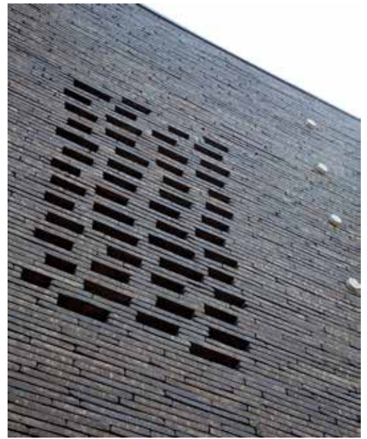
Wasserstrich Special Black