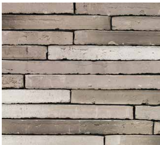
Wasserstrich Special Quartz-Grey ± 510x100x40 mm