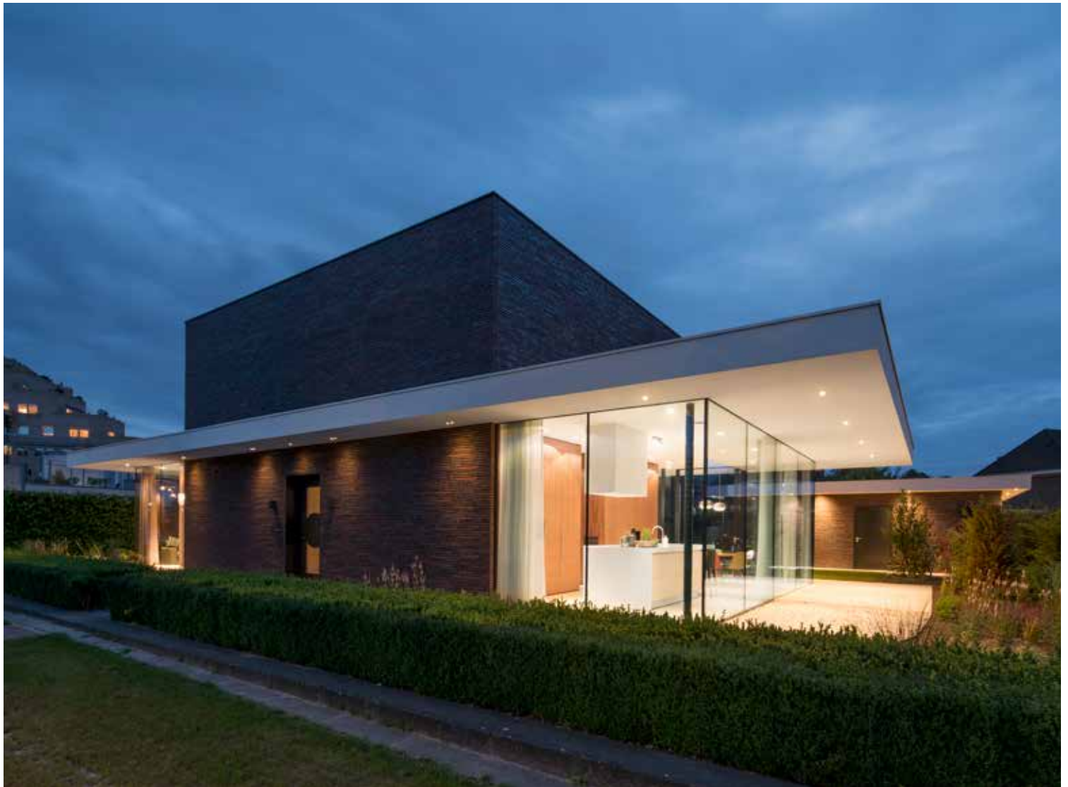
Wasserstrich Special E1

"The slender, long façade bricks create an elegant façade."