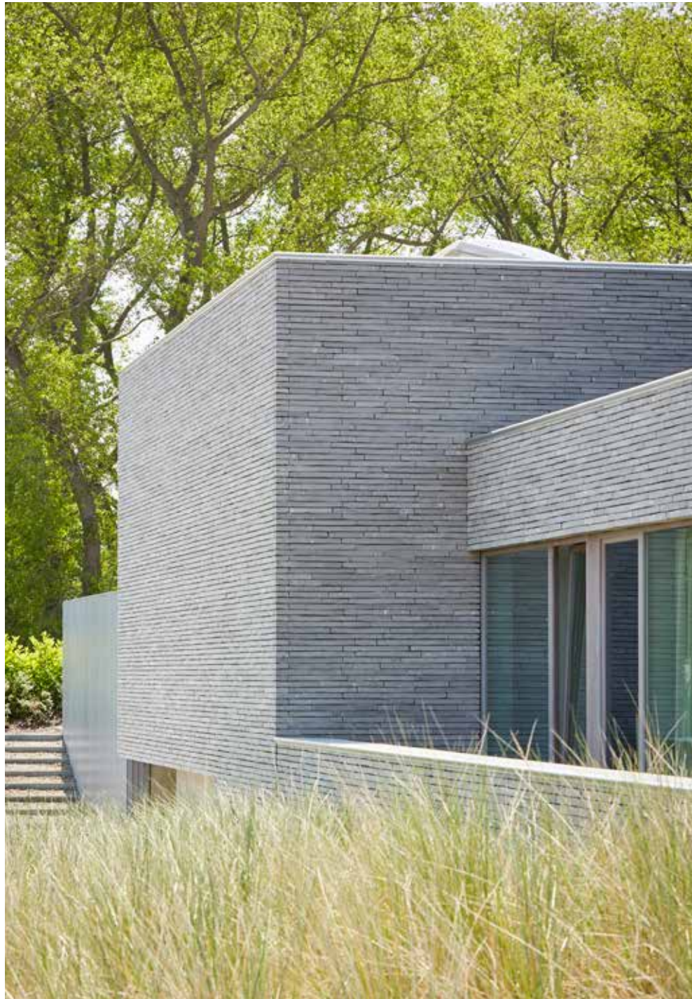
Wasserstrich Special Grey

pvl architecten, Pieter Popeye, Oostduinkerke