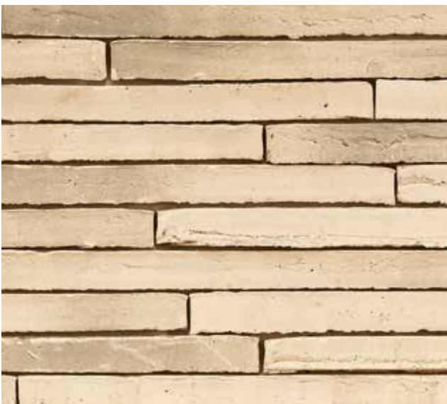
Wasserstrich Special Opal-White ± 510x100x40 mm