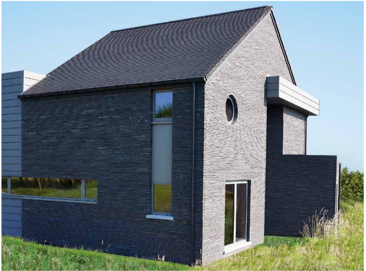
Façade: Wasserstrich Special Black / Roof: Koramic Plain Tile 301 Braised Blue