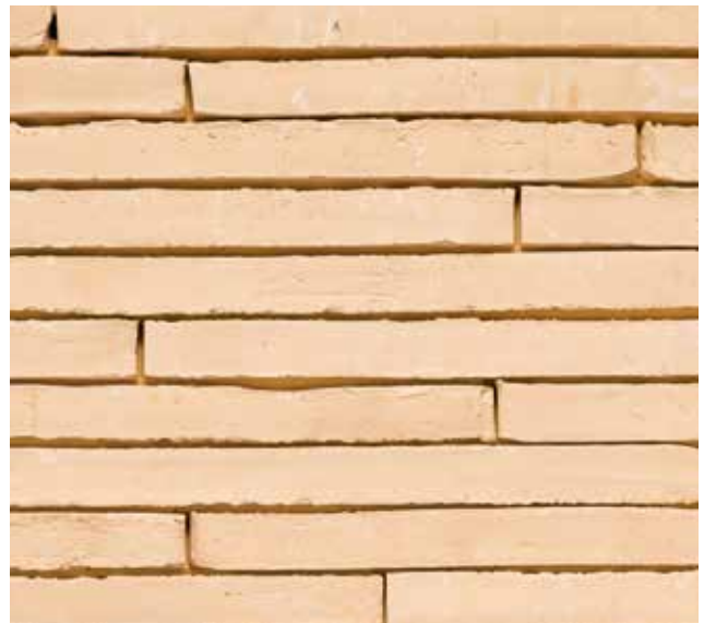
Wasserstrich Special Ecrú ± 510x100x40 mm