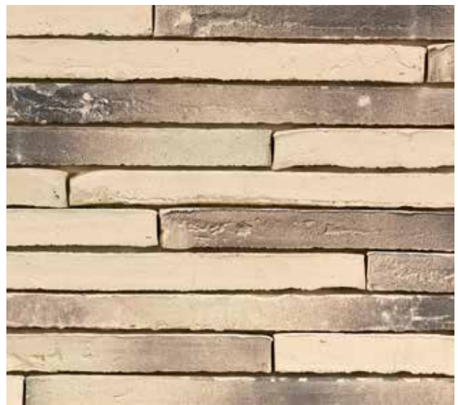
Wasserstrich Special Grey-White ± 510x100x40 mm