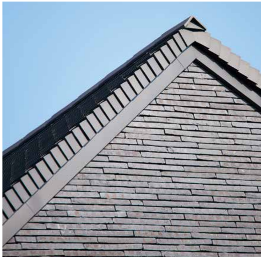
Wasserstrich Special Black