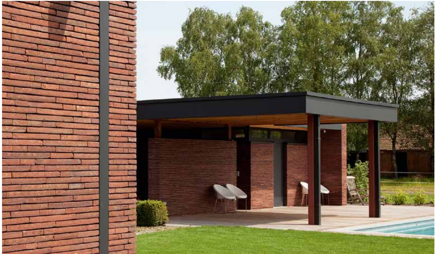
Wasserstrich Special Red

Architectenburo Anja Vissers, Anja Vissers, Herentals