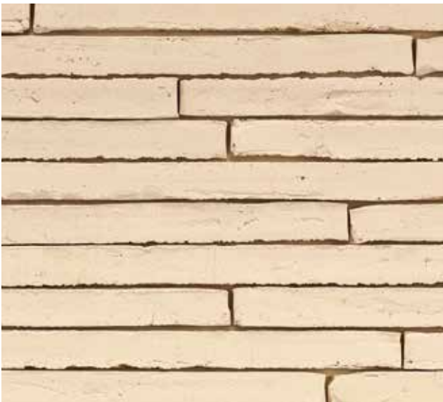
Wasserstrich Special White ± 510x100x40 mm

You choose one main colour, and you get all the shades and hues thrown in!