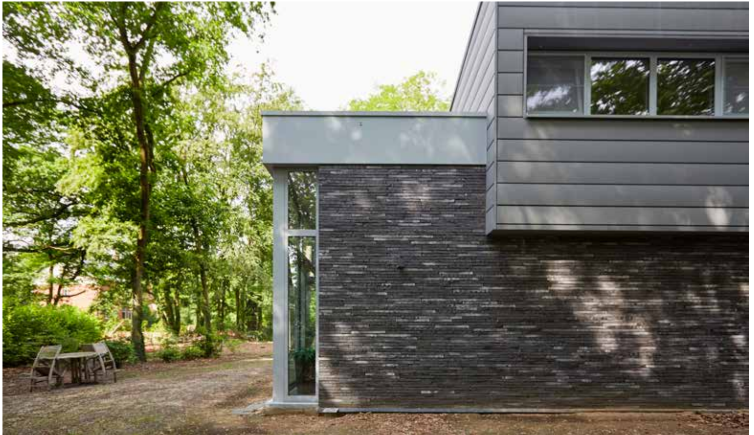
Wasserstrich Special E2