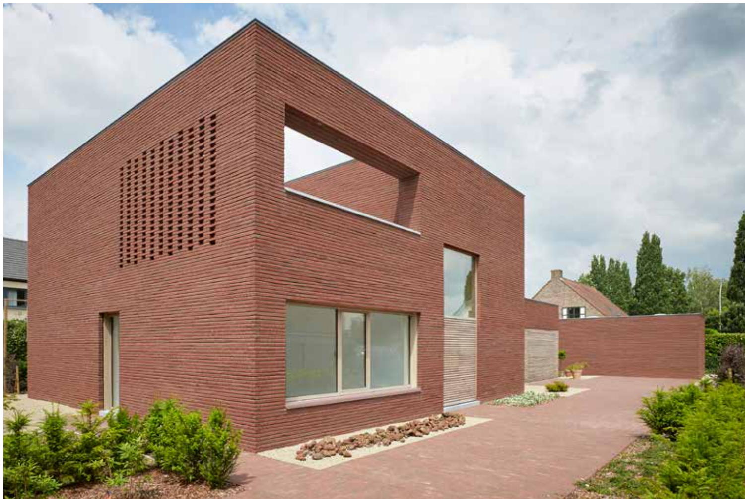
Façade: Wasserstrich Special Red / Clay clinkers: Oud Hollands Oud Veendam