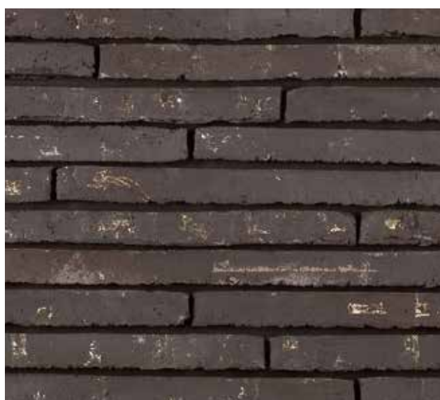
Wasserstrich Special Black ± 495x100x38 mm