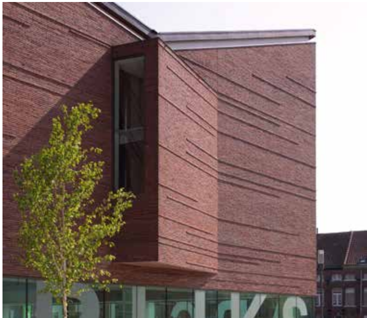
Wasserstrich Special Red

"The long bricks create the illusion of a pile of old paper."