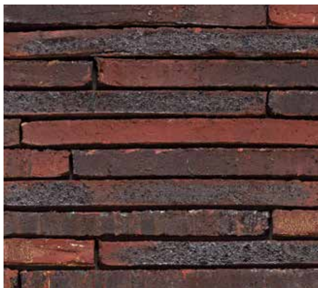
Wasserstrich Special E1 ± 495x100x38 mm