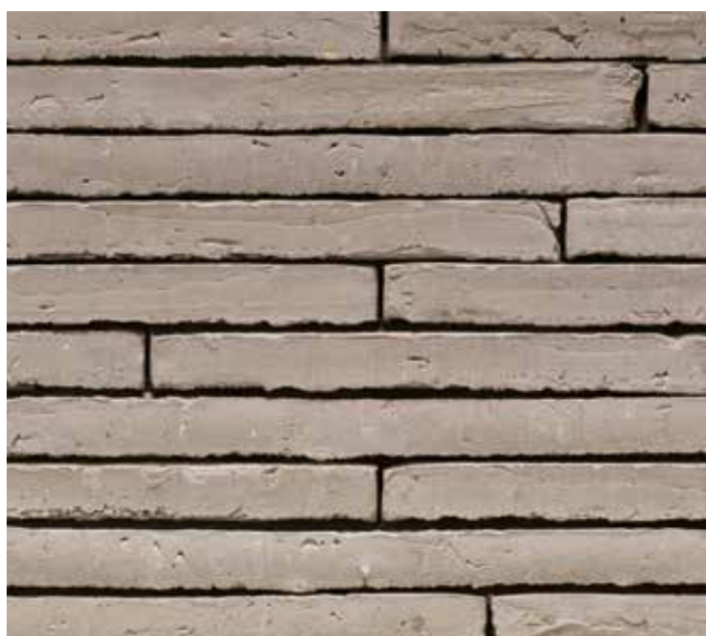
Wasserstrich Special Grey ± 510x100x40 mm